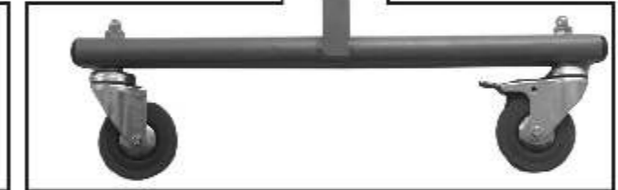
P-9 - 500x230x45x25 MM - QTY. - 4