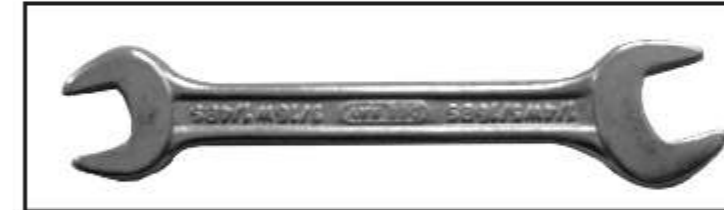
P-32 - 7.5/6 MM - QTY. - 2