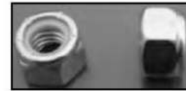
P-28 - 7.5MM - QTY. - 8