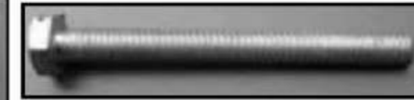
P-28 - 62x7.5MM - QTY. - 8